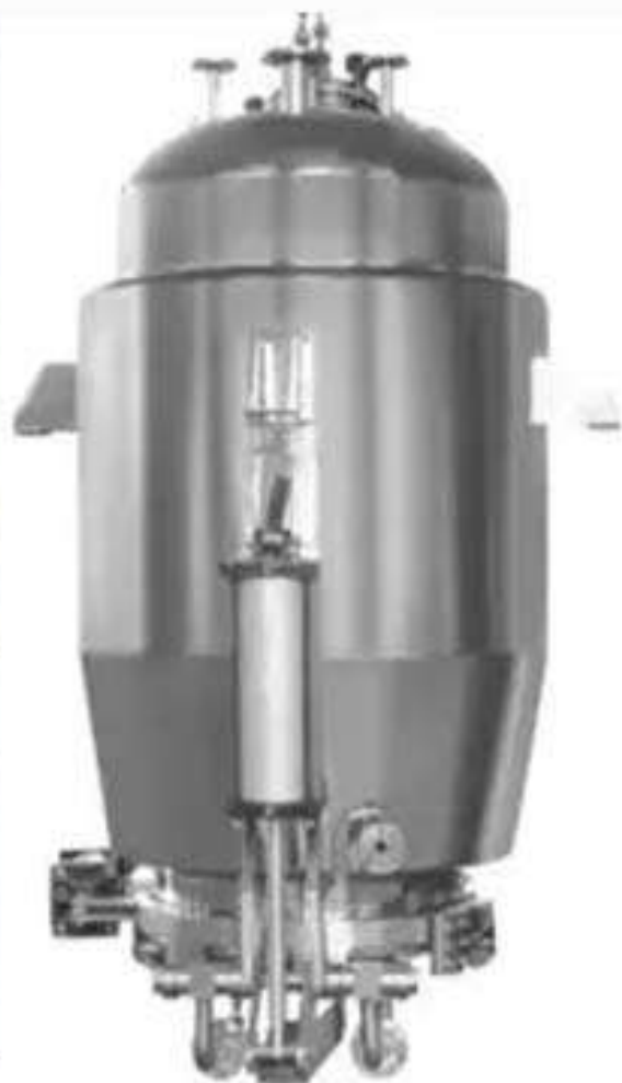
Steam jacketed Vessel Herbal Extraction vessel