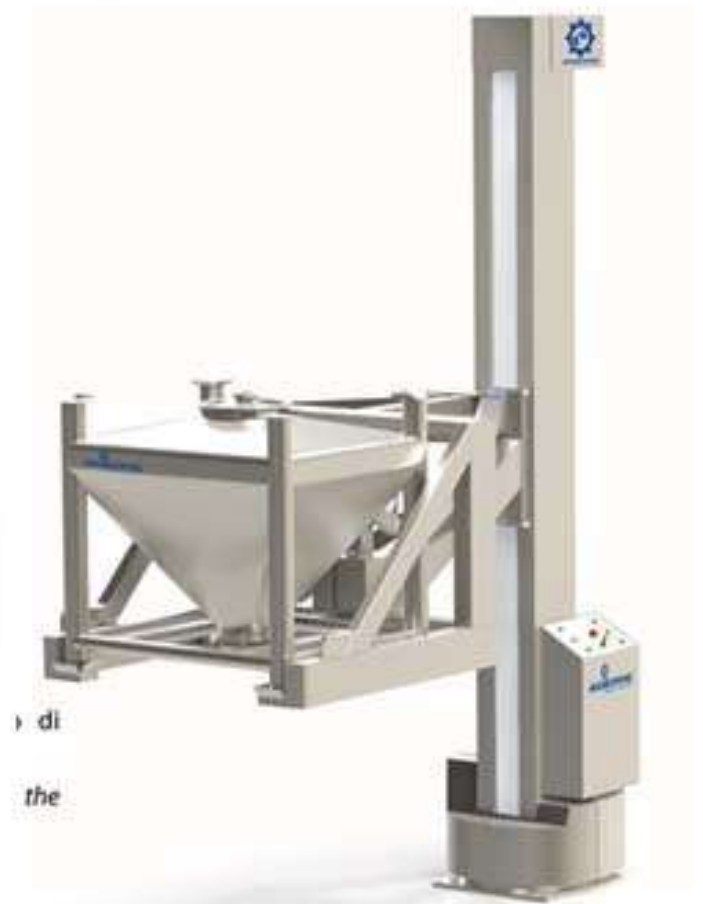
Con/Bin Blender and lifting column